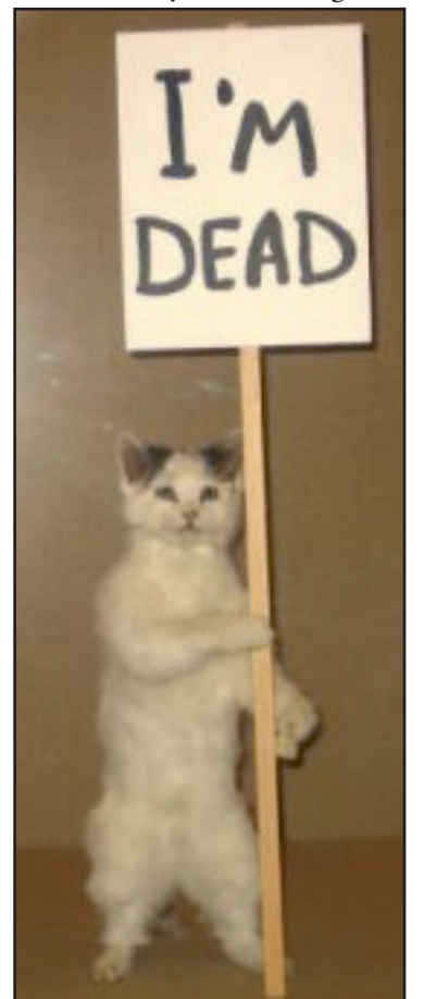
The ninja cat awaits his eternal fate at the Carnegie Museum.